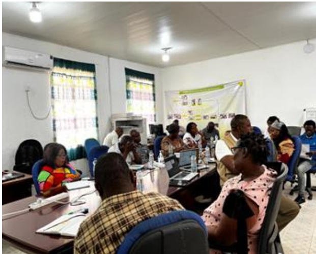
Figure 6. Participants at CDA Stakeholders Feedback Meeting at BGH on March 20 th , 2024.