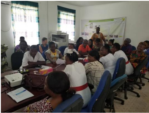
Figure 2. Child Death Audit Training at Bo Government Hospital

by the Directorate of RMNCAH+N was conducted at MRH and BGH (Figure 2) in January 2023 and November 2023 respectively. The training was aimed at building the capacity of health care workers to conduct routine child mortality audits within their facilities.