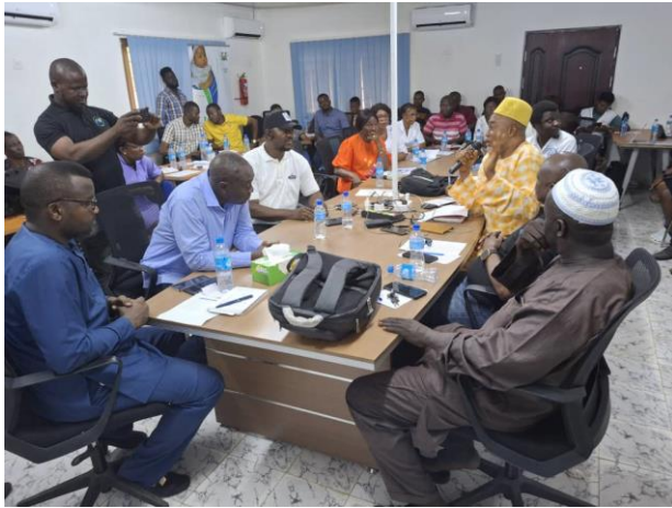
Figure 5. Cross section of participants at the CDA Stakeholders feedback meeting at Makeni on May 8 th , 2024 (The chairman of paramount chiefs, Bombali District addressing the participants on the need to support the health care workers at the hospital).

the issues raised. To reduce child mortality, CHAMPS is providing support to the hospital and district leadership to follow-up on meeting action points to enhance provision of timely good quality health care.