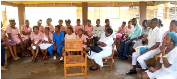
Figure 3. Weekly Child Death Audit Meeting at Makeni Regional Hospital