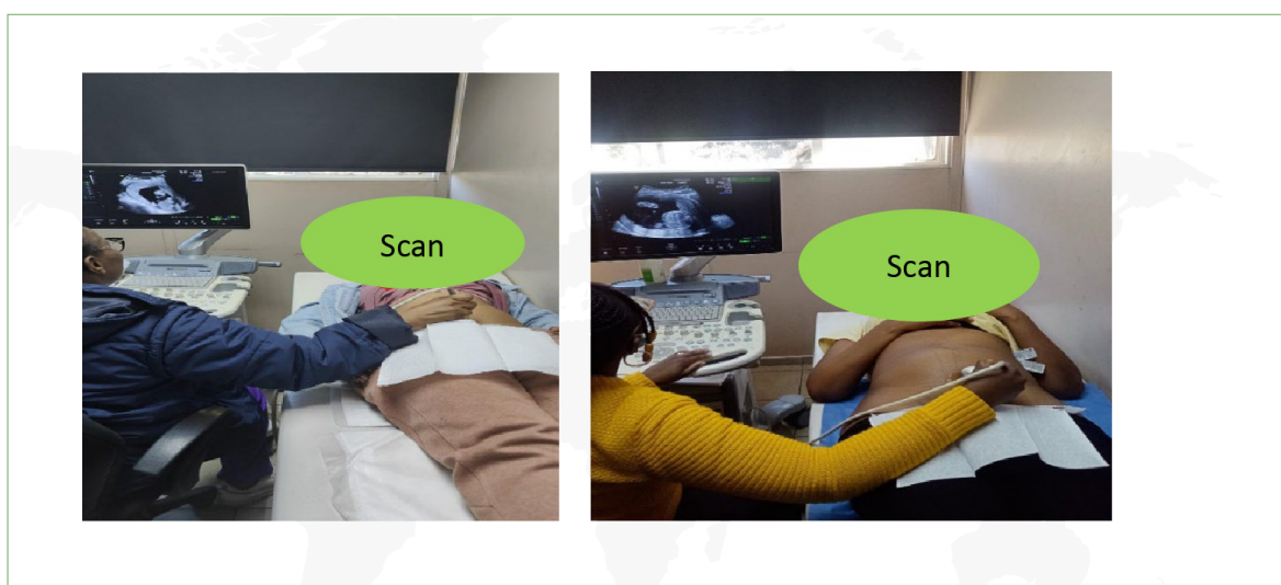
Figure 3: Provision of ultrasound scan services on weekdays and Saturdays

The intervention instituted ensured that there is continuous access of ultrasound during the week and created a platform for women who are unavailable during the week to access ultrasound on Saturdays (Figure 3). A total of 696 pregnancies were scanned from June 2023 to April 2024. The proportion of women scanned from June to October 2023 were higher (35%, n=246) than when services were offered Mondays to Friday only from November 2023 to January 2024.(16%, n=182) (Figure 1). The gestation of pregnancies scanned were 1-3weeks (10%, n=71), 14-23 weeks (41%, n=283), and 28-40 weeks (49%, n=342). These data suggest that there is a need to increase ultrasound services earlier in pregnancy, as almost half of the participants get ultrasound services in the third trimester. Almost 70% (n=492) of women who had ultrasound scan done have recorded outcomes. A large proportion (68.4%, n=476) of women delivered live births while 2.3% (n=16) were still births and the remaining 29.3% (n=204) were still pregnant at the time of this report.