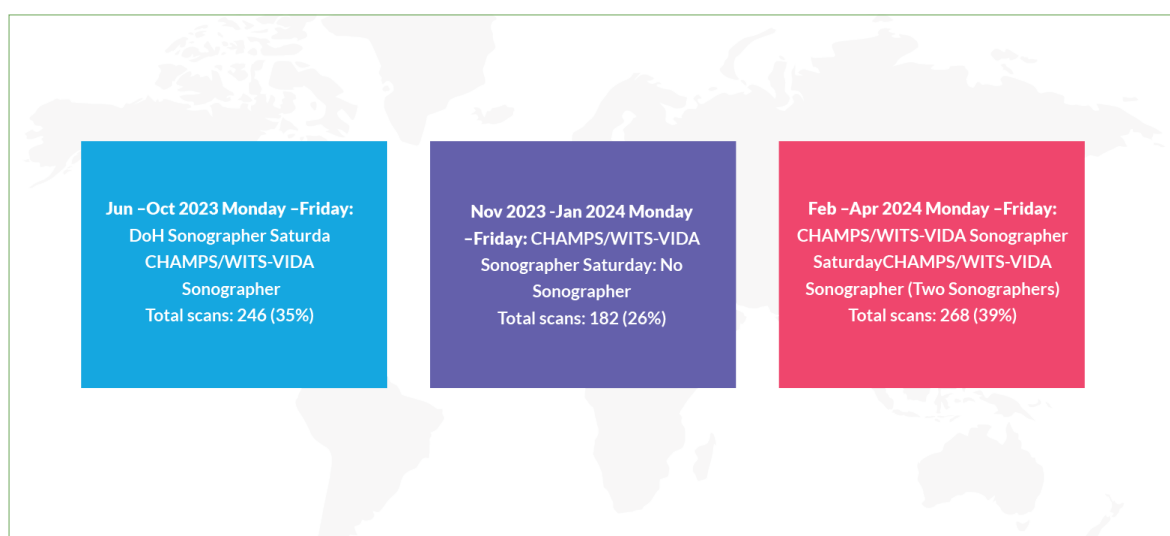
Figure 1: Sequence of events of the intervention process

To address the ultrasound service interruption and improve the access of ultrasound services to all pregnant women attending ANC, CHAMPS Pregnancy Surveillance program, Pregnancy Exposure Registry (PER) program and Vaccines and Infectious Diseases Analytics Research Unit, University of the Witwatersrand (WITS-VIDA) took an initiative to engage the facility managers and re-establishing the ultrasound services. From June 2023, the ultrasound scan services were provided by the Sonographer employed by the Department of Health (DoH) from Monday to Friday. An additional Sonographer was employed by the CHAMPS/WITS-VIDA to render ultrasound services on Saturdays (Figure 1). As the DoH Sonographer resigned from the post, CHAMPS/WITS-VIDA offered Sonographer to MOUs from November 2023 working Mondays to Fridays. The services were further expanded by an additional Sonographer offering services on Saturdays only in February 2024 (Figure 1).