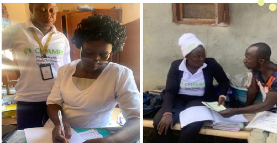
Figure 3. Clinical mentoring in a pilot PHU (L) and community (R).