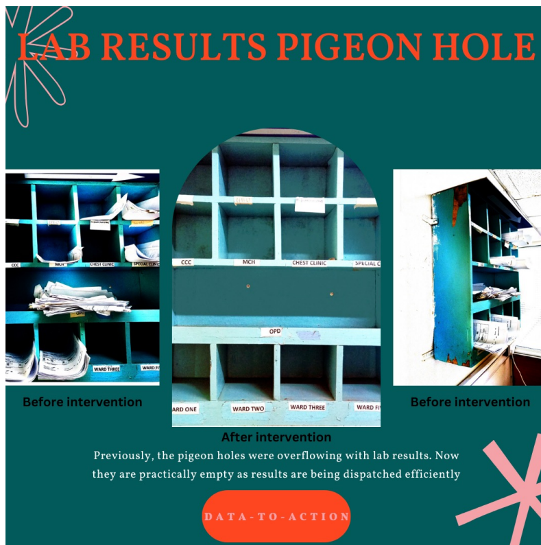
Figure 1. Pigeonhole: Before and after the intervention

To ensure compliance, the laboratory manager conducted spot checks. Notably, these gains have been sustained over four years, even with changes in the leadership of the laboratory.